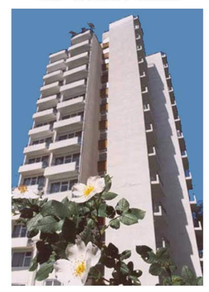
26 June - 2 July 2016 Kiten, Bulgaria